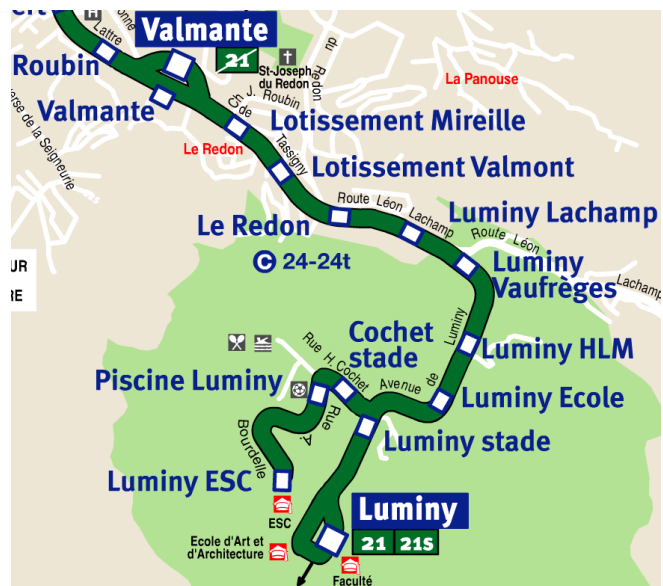
End of line 21